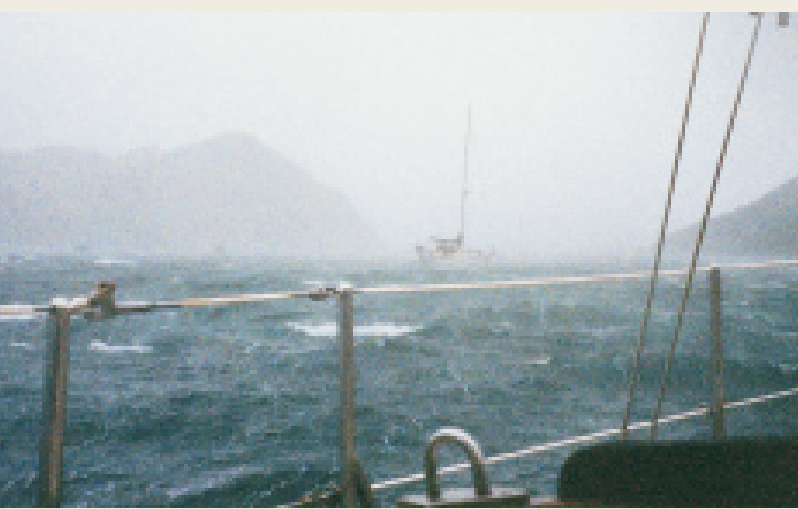
Kindred Spirit , a Tayana 42, dragged early in the storm, but her crew was able to reset the anchor in the eye.

Summerwind , a 41-foot Hardin Sea Wolf ketch with two people on board, chose to lie to a mooring in the Waiting Room. The moor-